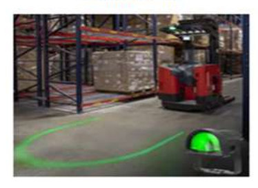
Green LED Forklift Safety/Warning Light w/ Arc Beam Pattern