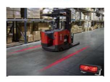
Forklift Red Light - LED Safety Light with Line Beam Pattern - Single