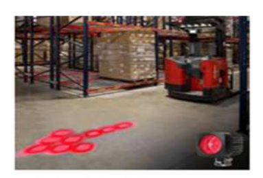
Red LED Forklift Safety/Warning Light with Sequential Flashing Arrow Beam Pattern