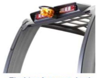
Flashing beacon, backup alarm

GIVE US A CALL FOR YOUR NEXT RENTAL +971-52-248-2445