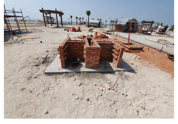
BBQ SETUP BBQ SETUP